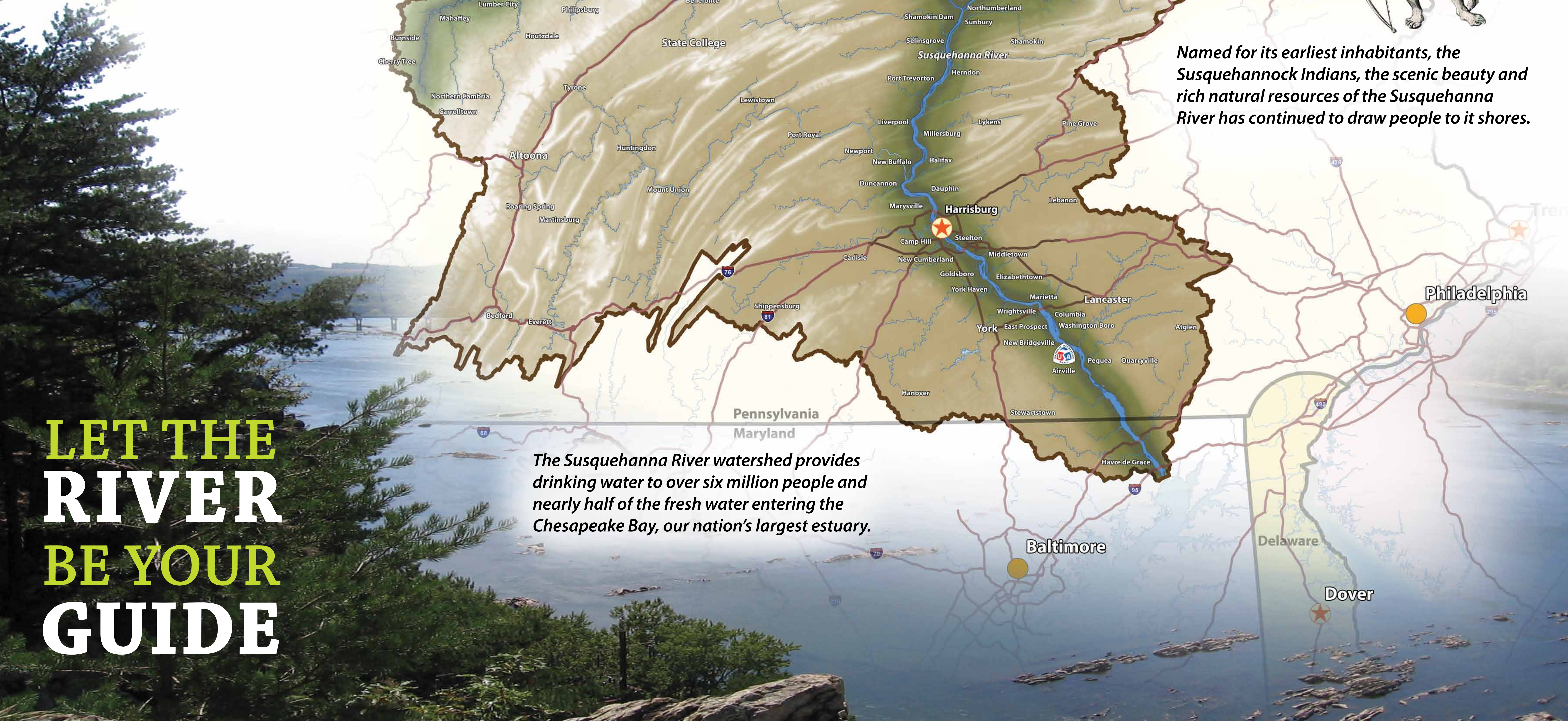
The Susquehanna River watershed provides drinking water to over six million people and nearly half of the fresh water entering the Chesapeake Bay, our nation's largest estuary.