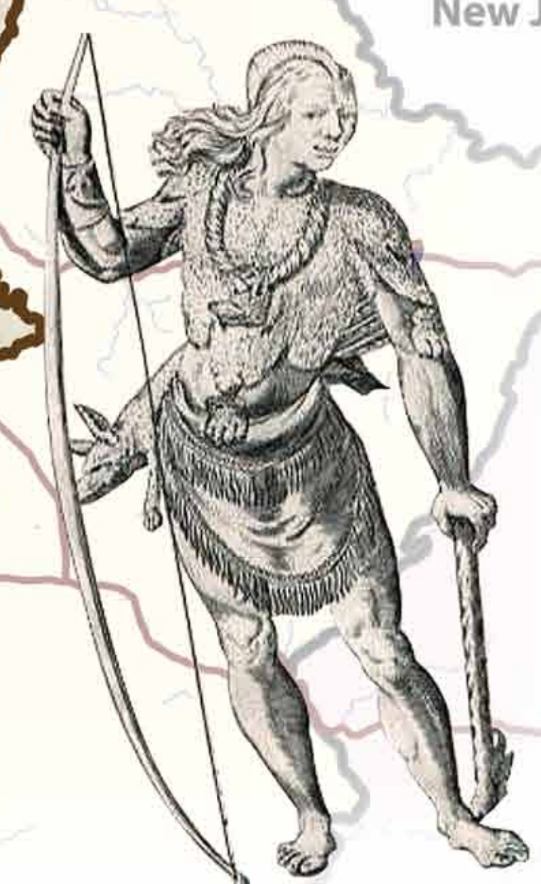
Named for its earliest inhabitants, the Susquehannock Indians, the scenic beauty and rich natural resources of the Susquehanna River has continued to draw people to its shores.